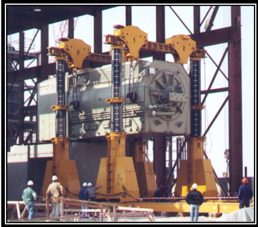
J&R 1402-4-39 Octagon LIFT-N-LOCK Hydraulic Boom Gantry with 150 Ton PowerLinks on a project in Riyadh, Saudi Arabia