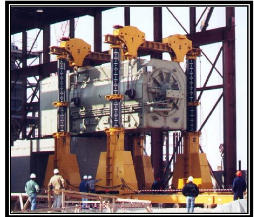
J&R 1402-4-39 Octagon LIFT-N-LOCK Hydraulic Boom Gantry with 150 Ton PowerLinks on a project in Riyadh, Saudia Arabia